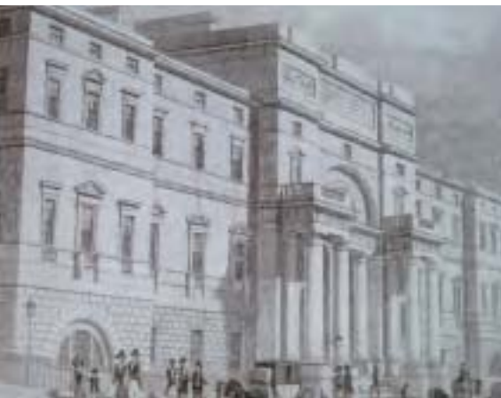
▲ Edinburgh University

Afternoon: Information & Communications Technology (ICT) and English Language, Music