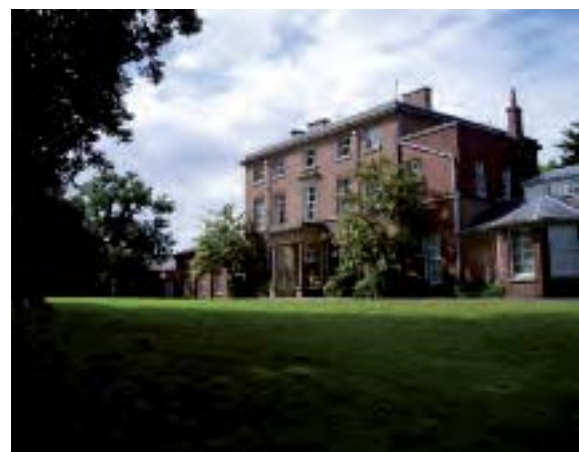
▲ The Mount

'In his early years, he attended the Unitarian Church in town with his mother, which preached relatively progressive ideas.