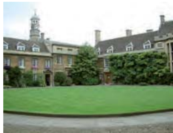
▲ Christ's College, University of Cambridge

Just at that moment, the bell rang, signalling the end of class and the group all trooped out into the schoolyard.