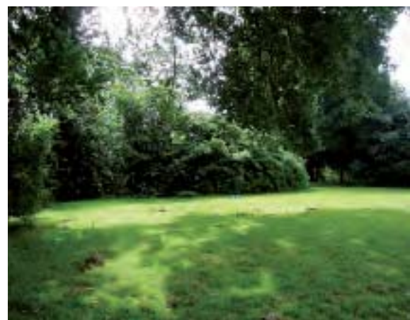
▲ Garden at The Mount