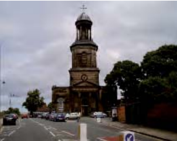
▲ St. Chad's Church