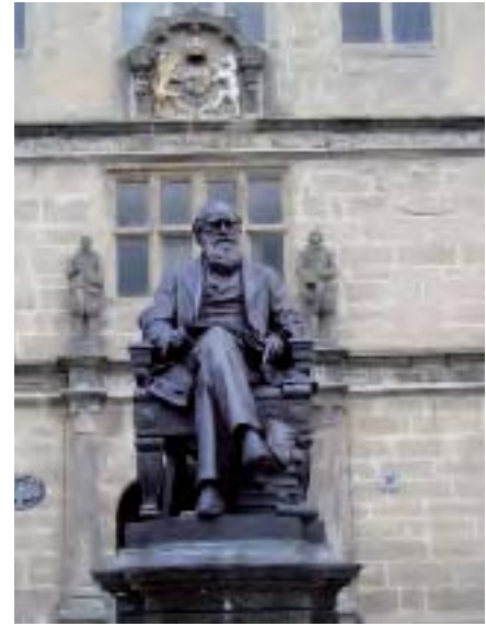
▲ Shrewsbury School with statue of Darwin outside. Now the town's Public Library