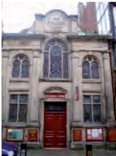
▲ Shrewsbury Unitarian Church